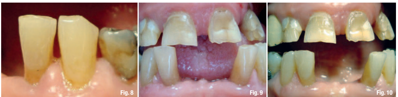
Fig. 8_ Six months after laser gingivectomy. Fig. 9_ Two months later. Fig. 10_ Six months after laser gingivectomy.